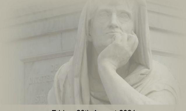
Friday, 20th August 2021

Concluding discussion (on "Zoom" and afterwards on "Wonder")